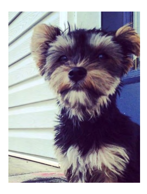
Alison Keeney is on the hunt for a Morkie! Morkies are a cross between a Yorkshire Terrier and a Maltese. They are a small breed dog and typically weigh around five to eight pounds when fully grown. Alison is currently an aunt to a sweet male Morkie named Bardo whom is pictured on the deck.