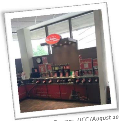
Tim Hortons Express, UCC (August 2015)

This unit was closed on June 26 and will reopen in late August as we are undergoing a significant renovation of this 25-year-old unit. In September, this operation will expand from two to three cash registers, and will have new front counters, equipment, and a double sandwich station located behind cash #1. The bakery will be immediately behind the unit in the area currently occupied by Pizza Pizza, and everything will be completely self-enclosed and self-sustaining. There will be a significant increase in space allocated to this facility that will work out better for both staff and customers. We'll also be going into the panini and iced coffee programs, and, we'll be able to accept Tim Cards, the first unit on campus to do this. It's going to be WOW!!!