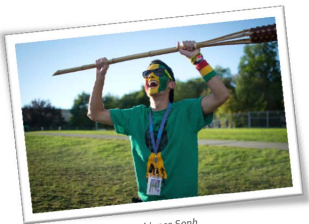
2014-2015 Saugeen Residence Soph

Orientation will continue throughout the fall with special events, programs, and activities to keep the campus spirit alive. If you are a Western Staff Member or Faculty Member and would like a time slot for an O-Month event, please submit your proposal. Any additional questions may be emailed to aoc@uwo.ca