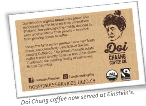
Doi Chang coffee now served at Einstein's.

and baked goods will occur in the second week of September, the first full week of classes.